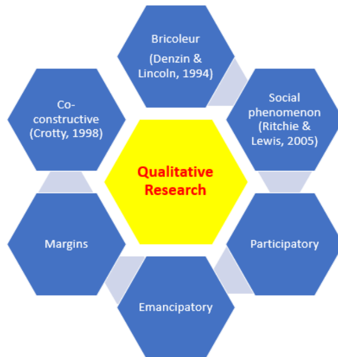
Figure 2: Fundamentals of Qualitative Research

When considering the above caveats for qualitative research in a post pandemic era therefore, the legitimacy of data collected via virtual means will depend on how researchers confront and theorise their data collection process such that Tracks 1 and 2 will be able to justify why and how the method was appropriated for the context.