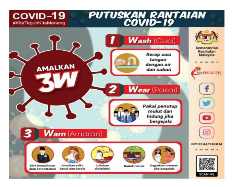
Figure 2: Amalkan 3W - Practice 3 W: Safety measures for the "new normal", Malaysian Ministry of Health (2020)