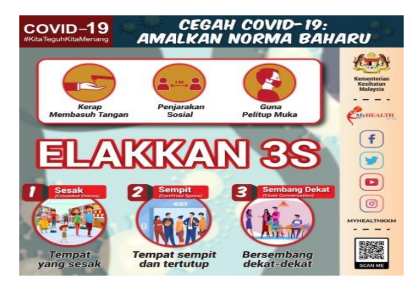
Figure 2: Elakkan 3S - Avoid 3S: Safety measures for the " new normal ", Malaysian Ministry of Health (2020)

Due to the vagueness of this disease, there was a great deal of confusion and misunderstanding about the virus itself. Questions included, how did it spread? What were the safety precautions that should be taken to prevent transmission of the disease? These unknown factors became increasingly challenging for the authorities as vast amounts of misinformation were disseminated on social media which was confusing people's understanding of COVID-19 (Muhamad and Azlan, 2020). When the initial MCO announcement was made, Malaysians reacted in panic and confusion, not unlike the global response. Apart from panic buying, people overloaded public transportation centres to travel back to their kampongs (hometown villages), potentially increasing the risk of infection to other parts of the country. While this reaction to the MCO was not unexpected, it raised questions regarding the level of understanding, and attitudes toward COVID-19 among Malaysians. Maslow's hierarchy of needs therefore provides a framework for understanding people's motivation, feelings and practices toward COVID-19 and how they play an integral role in determining a community's response, reaction and compliance with behavioural change measures from health authorities.